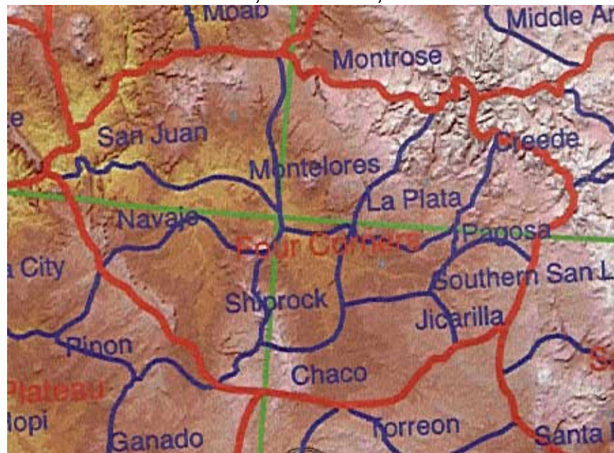
Figure Three Social Resource Units of Colorado